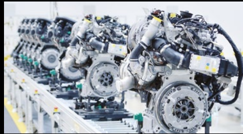
Identification of engine parts during assembly